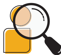
Listening to Customers

We serve our clients with integrity and commitment, performing at the highest standards and acting in accordance with our core values.