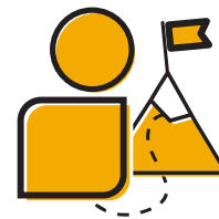
Believing in Flexibility